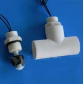
MODEL NO. : FSF - 100