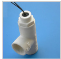
MODEL NO. : FS - 100 FOR GAS BOILER