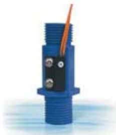
MODEL NO. : 14 - BPMT PP FLOW SWITCH Size : 1/2"

MATERIAL :SUS304 PRESSURE: ≥10 BAR TEMPE RATING: -30C TO +140C MAX CONTACT RATING: 50W MAX SWITCHING VOLTAGE:≤48VDC (12,24V) MAX SWITCHING CURRENT: 0.5A MOUNTING POSITION : UNIVERSAL