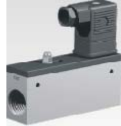
MODEL NO : FS – 4B CAS