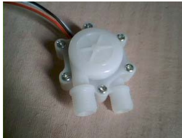
MODEL NO : BI 100 A