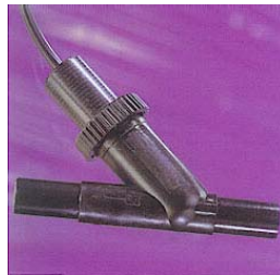
MODEL NO.: CRY-03 FLOW SWITCH MOUNTING : VERTICAL / HORIZONTAL MAX. PRESSURE : 10 BAR MAX. TEMP : 85° C END DIA.: 22 MM / 15 MM .O.D. SWITCHING CAPACITY : 15 VA , 240 AC MODEL NO. : FS 22 / FS 15 /FS 15 LF

FLOW SWITCH ADJUSTABLE TYPE MOUNTING : VERTICAL RANGE : 0-4 LPM AIR