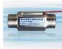
MODEL NO. : 14-SSFS SS FLOW SWITCH Size : 3/4"

MATERIAL : SUS304 PRESSURE: ≥10 BAR TEMP: -30C TO 140C MAX CONTACT RATING : 50W MAX SWITCHING VOLTAGE:≤48VDC (12,24V) MAX SWITCHING CURRENT: 0.5A MOUNTING : UNIVERSAL