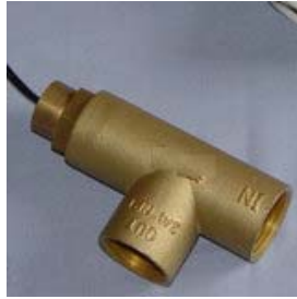
MODEL NO. : FS - 201