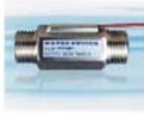
MODEL NO. : 14-SSFS SS FLOW SWITCH Size : 1/2"

MATERIAL : SUS304 PRESSURE: ≥10 BAR TEMP: -30C TO 140C MAX CONTACT RATING : 50W MAX SWITCHING VOLTAGE:≤48VDC (12,24V) MAX SWITCHING CURRENT: 0.5A MOUNTING : UNIVERSAL