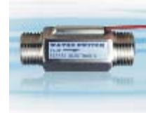
MODEL NO. : 14-SSFS SS FLOW SWITCH Size : 1"

MATERIAL : SUS304 PRESSURE: ≥10 BAR TEMPE: -30C TO +140C MAX CONTACT RATING: 50W MAX SWITCHING VOLTAGE:≤48VDC (12,24V) MAX SWITCHING CURRENT: 0.5A MOUNTING POSITION : UNIVERSAL