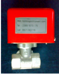
MODEL NO : 14 – MT

“T” TYPE FLOW SWITCH WATER FLOW SWITCH FLOW CUT-OFF ADJUSTABLE