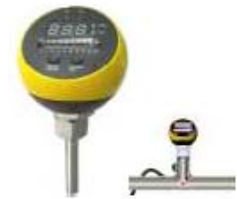
MODEL NO : BI0004 DIGITAL FLOW SWITCH DISPLAY : VELOCITY SMART FLOW SENSOR FLOW + TEMPRATURE SENSOR COMPACT TYPE FOR ADAPTOR SENSING MEDIUM : AIR, LIQUID LIQUID FLOW RANGE : 3....300CM/S GAS FLOW RANGE : 200...3000CM/S TEMPRATURE RANGE : 25....80deg.C OUTPUT SWITCHING (NPN/PNP NO/NC) ANALOG (4 – 20Ma) RELAY DISPLAY : LED