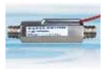
MODEL NO. : 14 - SSFS SS FLOW SWITCH Size : 1/4"

PRESSURE: ≥ 10 BAR TEMPE RATING: -30C TO + 90C MAX CONTACT RATING : 10W MAX SWITCHING VOLTAGE : 180VDC MAX SWITCHING CURRENT : 0.5A MOUNTING POSITION :VERTICAL