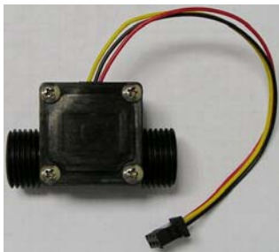
MODEL NO : BI 200 A