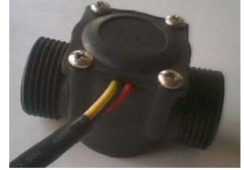
MODEL NO : BI 300 A