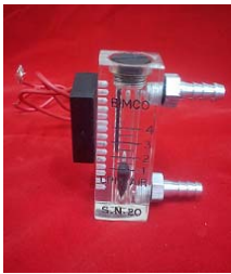
MODEL NO : LO – FLO – SW VERY LOW RANGE FLOW SWITCH CUM INDICATOR

FLOW SWITCH ADJUSTABLE TYPE MOUNTING : VERTICAL RANGE : 0-4 LPM AIR